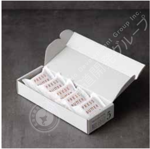
Caramel Cream Sandwich Cookies Original flavor 5 pieces