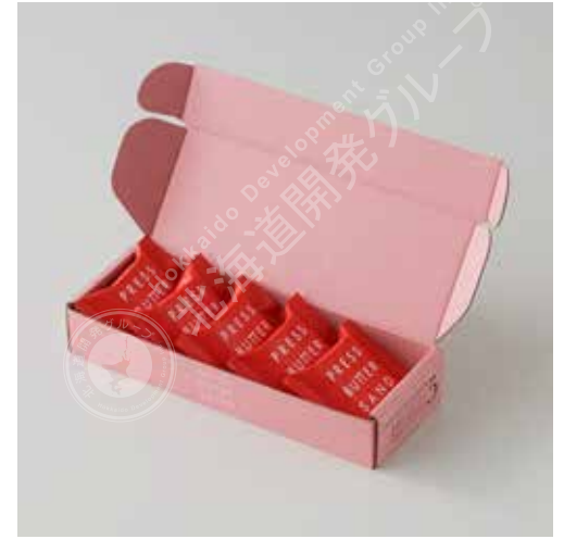
Caramel Cream Sandwich Cookies Fukuoka strawberries 5 pieces Kyushu limited