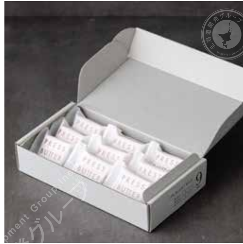
Caramel Cream Sandwich Cookies Original flavor 9 pieces