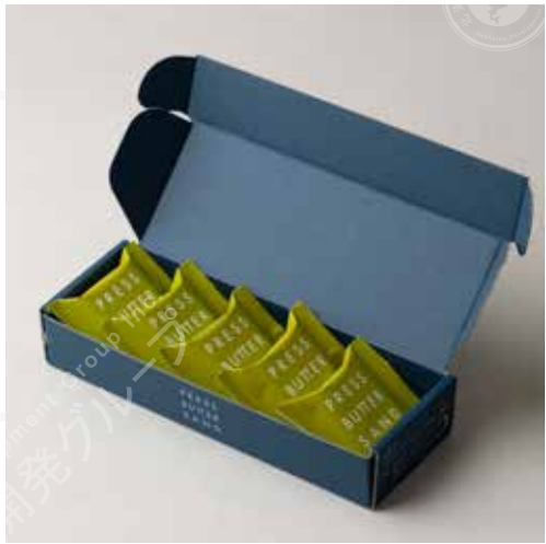
Caramel Cream Sandwich Cookies Uji Matcha 5 pieces Kansai limited