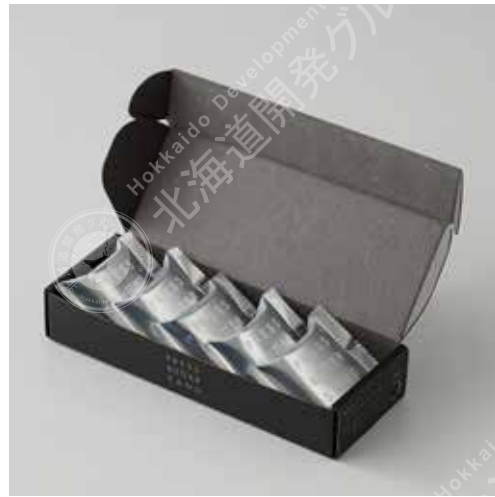
Caramel Cream Sandwich Cookies Rum chocolate 5 pieces Kanto limited