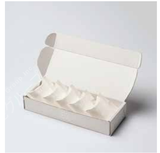
Caramel Cream Sandwich Cookies Vanilla white chocolate 5 pieces Hokkaido limited